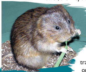
Water Vole ( Arvicola Terristris )

As the path moves up to higher ground, you will be treated to views of the water meadows and the town beyond on your left and the AFC ground, the home of Sudbury's football club, on your right. Continue along the track, passing by the ramp to the pumping station on your left, and on past Friars Meadow (suitable for picnics) on the right, until you return to the car park where your walk began.