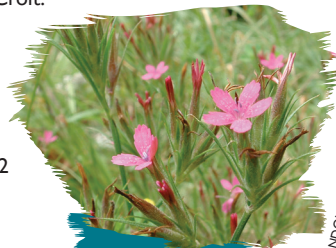
Deptford Pink ( Dianthus Armeria )

Just after crossing another old railway bridge over busy Ballingdon Street, turn right and take the ramp down to the red-brick pumping station below you. Look out for the high flood water marks on the wall. Passing through the gate bear right across the meadows to the footbridge and after crossing, go directly ahead towards the Mill Hotel and mill pool. Watch out for Kingfishers. Turn left at the mill, walk along by the mill stream and follow the path to the floodgates and beyond it to the Croft.