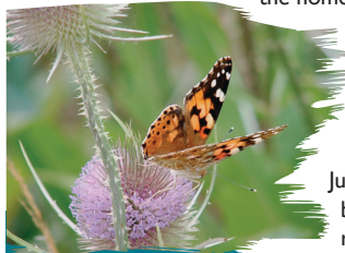
Painted Lady ( Vanessa Cardui )

Starting in the south-east corner of the Kingfisher Leisure Centre car park, follow the old railway track, formerly a section of the Stour Valley Line from Sudbury to Cambridge. Look out for the Quay Basin on your right (now the home of the Quay Theatre and Sudbury Rowing Club) as you pass over a railway bridge, from where locally made bricks were transported down the river and then on by sea to London.