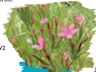
Deptford Pink ( Dianthus Armeria )

From the Croft junction continue along the path until very shortly you reach the old bathing pool, where you cross the bridge to your right and follow the riverside. Continue along by the river, passing the Salmon Leap Weir and a WW2 Pillbox on the opposite bank. Watch out for harmless grass snakes and water voles.