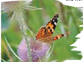
Painted Lady ( Vanessa Cardui )

Starting in the south-east corner of the Kingfisher Leisure Centre car park, follow the old railway track, formerly a section of the Stour Valley Line from Sudbury to Cambridge. Look out for the Quay Basin on your right (now the home of the Quay Theatre and Sudbury Rowing Club) as you pass over a railway bridge, from where locally made bricks were transported down the river and then on by sea to London.