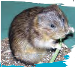
Water Vole ( Arvicola Terristris )

Turn left where the Meadow Walk once again reconnects with the Valley Trail, the old railway track and another longer walk to Melford Country Park. Heading down towards a cutting with steep sides, look out for a fenced area to your left, which is managed to protect the nationally rare flower, the Deptford Pink and further along Twayblade orchids on the right-hand side as you pass beneath two very fine Victorian brick built bridges.